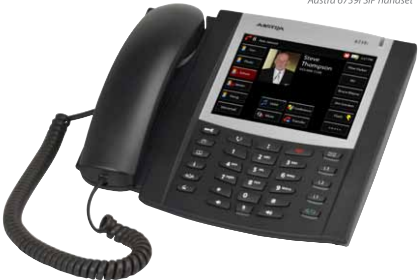
Aastra 6739j SIP handset

By effectively being available to manage and receive messages wherever you are, you need never again miss an urgent call or message. When at your PC, it becomes possible to access all messages on the same screen, showing the date, message type, status and sender. If away from your office you can instruct your system to notify you, wherever you are, of specific messages or those from specific senders. All your urgent messages – voice, fax, and