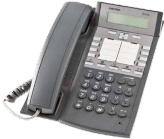
Aastra Dialog 7434ip handset

It should be remembered that some callers are uncomfortable using auto-attendant services, so the option to speak to a human operator should always be made available. To maximise the benefits offered by auto-attendant systems, the implementation must be managed well, as poor planning may lead to adverse reaction from customers and reduce staff morale.