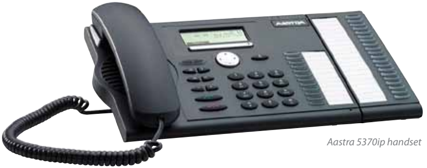
Aastra 5370ip handset