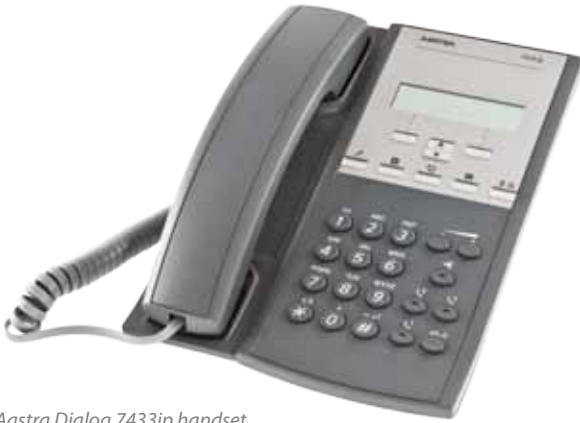
Aastra Dialog 7433ip handset